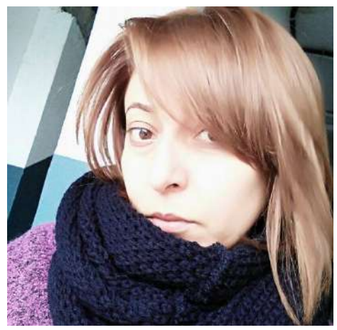
"Dear reader, I sincerely congratulate you with upcoming Christmas and New Year. Let 2017 be a year of personal happiness and protection of rights. With love and respect".