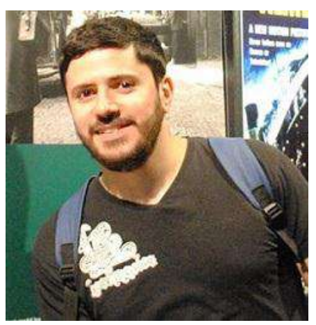
"Dear reader, I congratulate us all, and wish 2017 to be less disturbing and more successful year. Let your inner light never fade away".