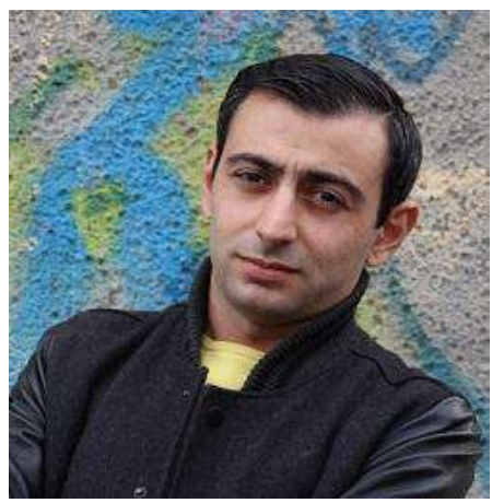
"I wish that 2017 embedding only good and positive developments in history. Increase in people's optimism and spiritual harmony"