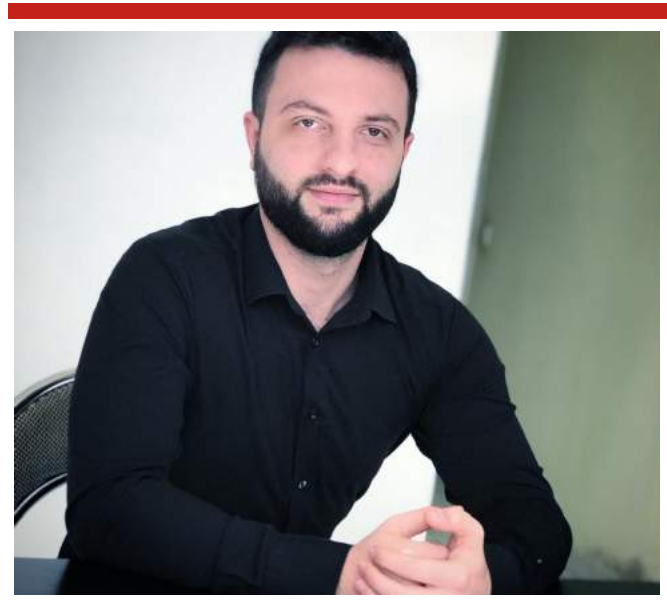
THERE WERE NO LOSING OR WINNING SIDES BUT THE DEMOCRACY AND TOLERANCE LOST.

This training is implemented by New Generation Humanitarian NGO in the framework of "Right to Health" project with the financial and technical support of the Eurasian Coalition on Male Health (ECOM) from the funds of the Global Fund to fight AIDS, tuberculosis and malaria.